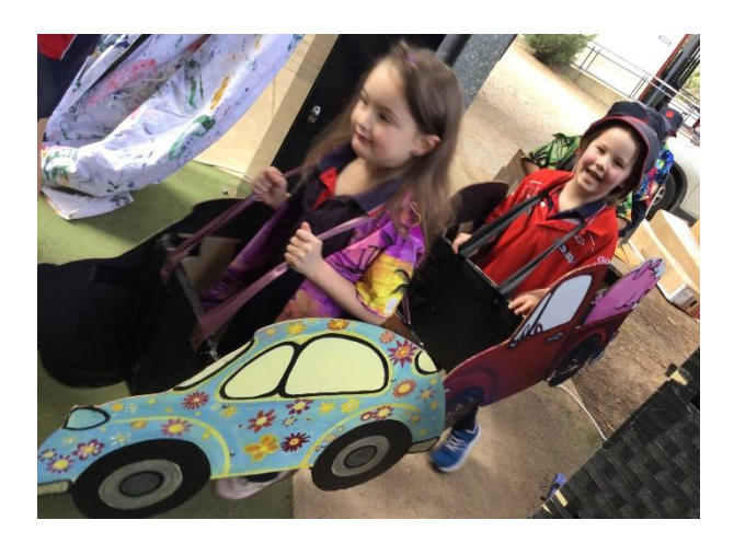
Getting some driving hours up before the show!