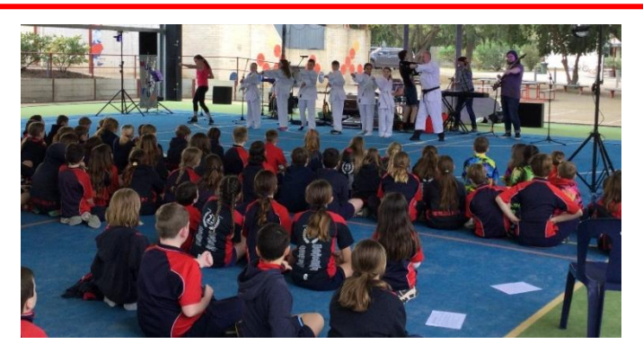
Kung Fu Fighting helpers put through their paces