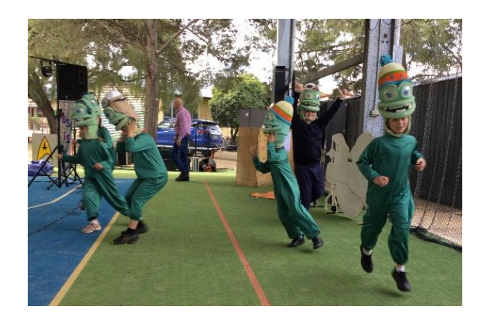
Watch out! Here come the Crazy Frogs!