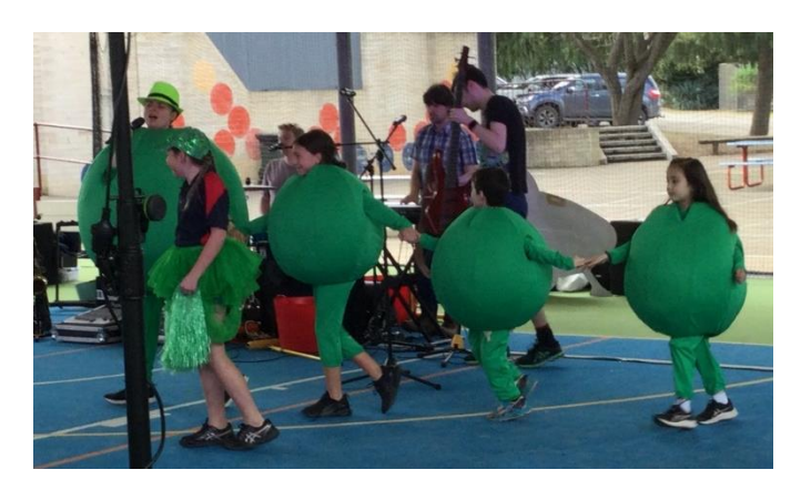
Our little Green Peas ready to boogie